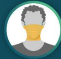
Nylon covering over mask