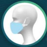
Medical procedure mask with knotted ear loops and tucked-in sides

Other effective options to improve fit include: