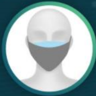
Cloth mask over medical procedure mask

In lab tests with dummies, exposure to potentially infectious aerosols decreased by about 95% when they both wore tightly fitted masks